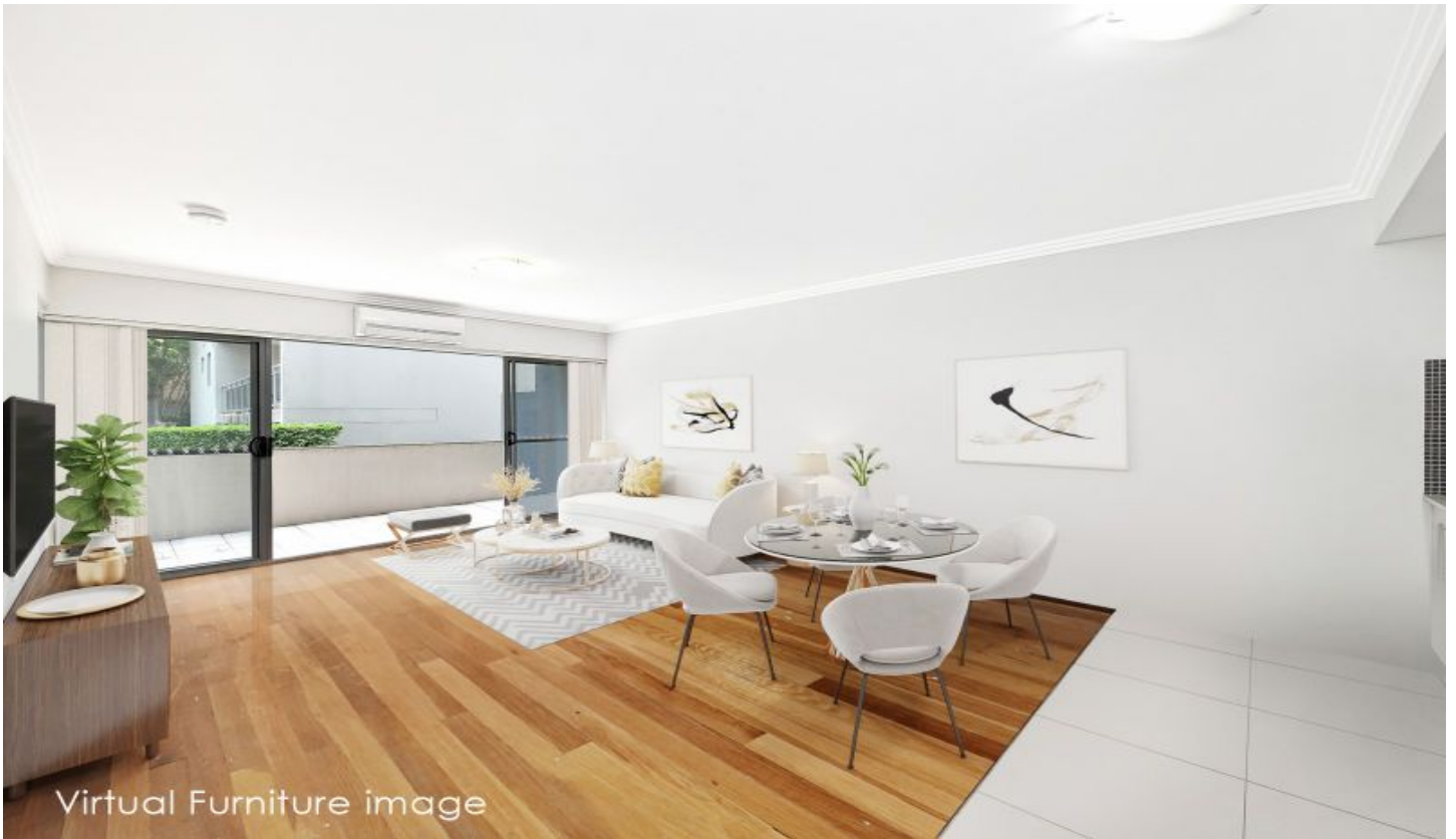
Virtual Furniture image