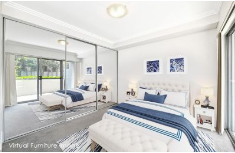
Virtual Furniture image