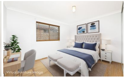
Virtual Furniture image