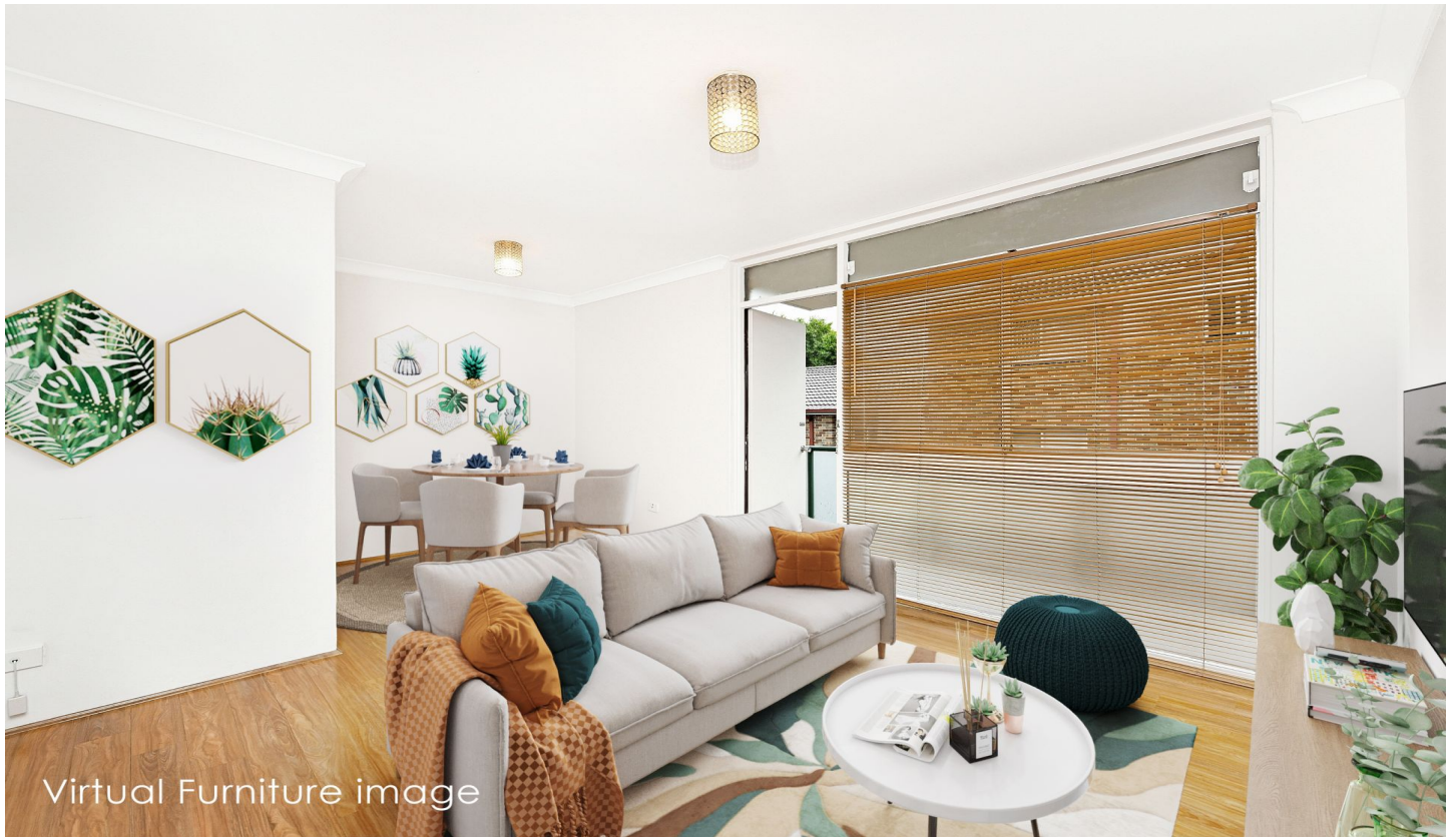
Virtual Furniture image